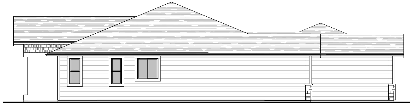
Side Elevation 3/32" = 1'-0"

250.852.8119 info@jfdesigns.ca www.jfdesigns.ca