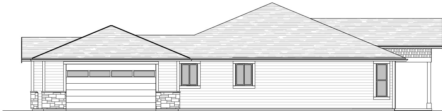
Side Elevation 3/32" = 1'-0"