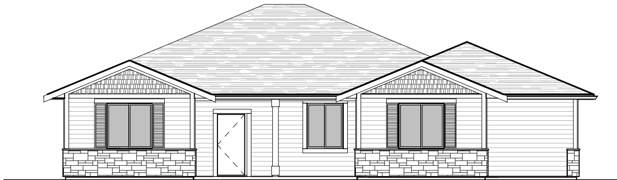
Front Elevation \frac{3}{32}'' = 1'-0''